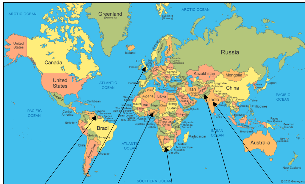
Guyana UK Nigeria South Africa Pakistan India